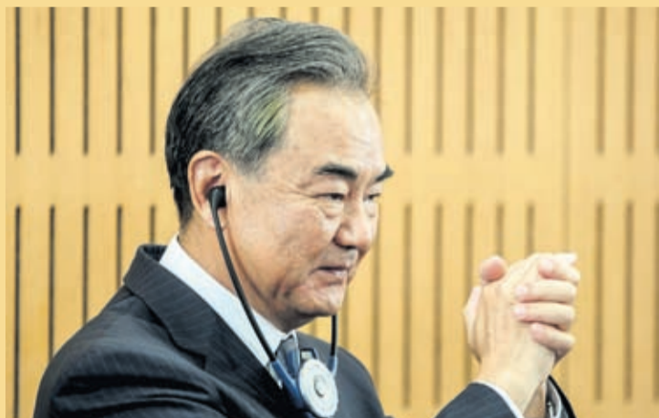
Chinese Foreign Minister Wang Yi greets the audience prior a press conference at the Institute for International Relations in Paris, Sunday, Aug. 30, 2020.